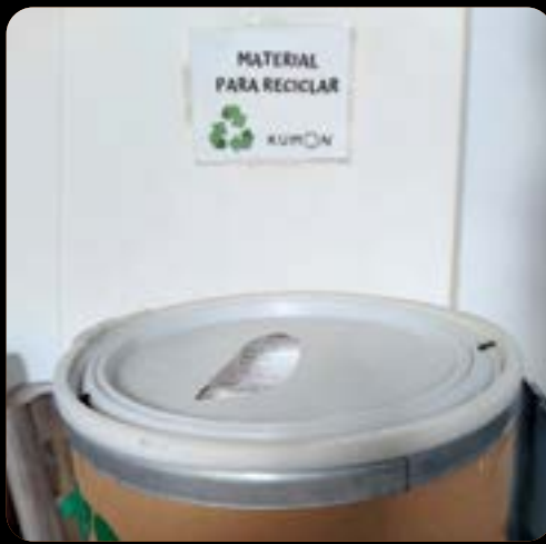
Worksheet recycling bin