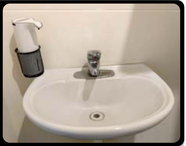
Biodegradable soap dispenser