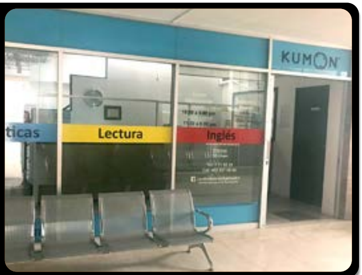
Centers participating in Daylight Hour