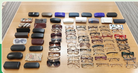
Used eyeglasses collected at our headquarters office in New Jersey.

The Green Team also continued to encourage associates to reuse, rather than throw out, unneeded items. We hosted both a used eyeglass drive in addition to our annual Winter Coat Drive at our headquarters office in New Jersey. We collected 118 pairs of eyeglasses, which were donated to the local Rutherford chapter of the Lions Club. Once collected the lenses are reused to benefit the visually impaired worldwide. The secretary of the Lions Club came to the office to collect the donation and personally thank Kumon for the contribution.