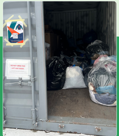
Dropping KNA's coat donations off at the Jersey Cares collection site.

In 2025 we're looking forward to rejuvenating KNA's Green Team and continuing to think of new ways to foster an eco-friendly lifestyle amongst Kumon's Associates and Instructors.